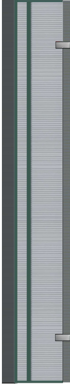
Proposed Rear Elevation (NEN) 1:100